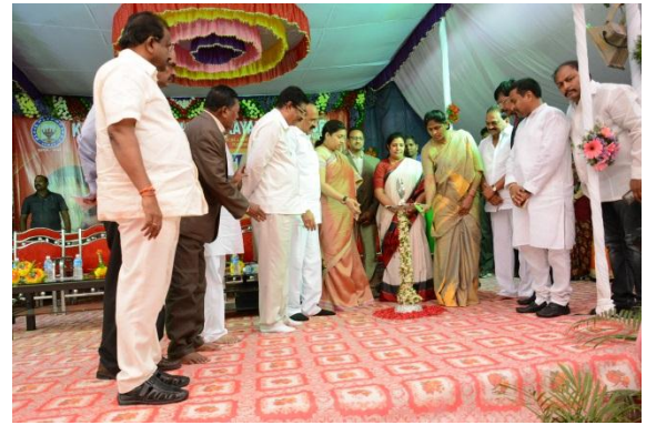
Lightening of the lamp by Honorable Ministers