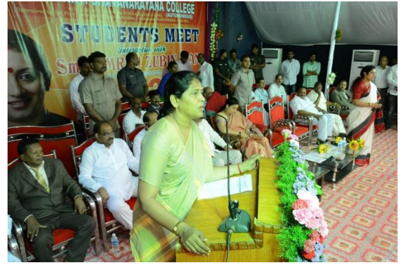
Speech by Jyoti Dhurve, Member of Lok Sabha