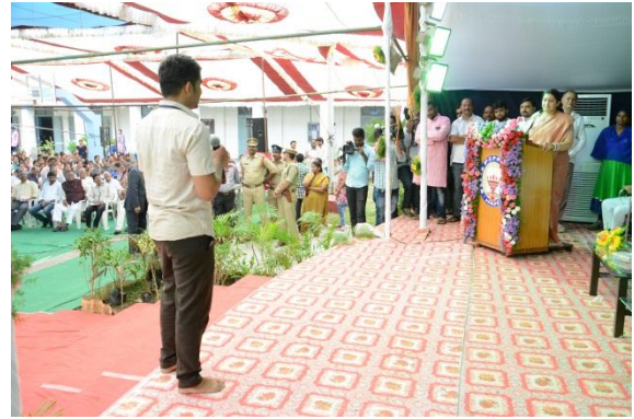
Smt. Smriti Jubin Irani, Human Resource Development Minister interacting with students