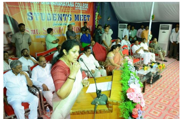
Speech by Smt. D. Purandareswari, Union Minister State, Commerce and Industry