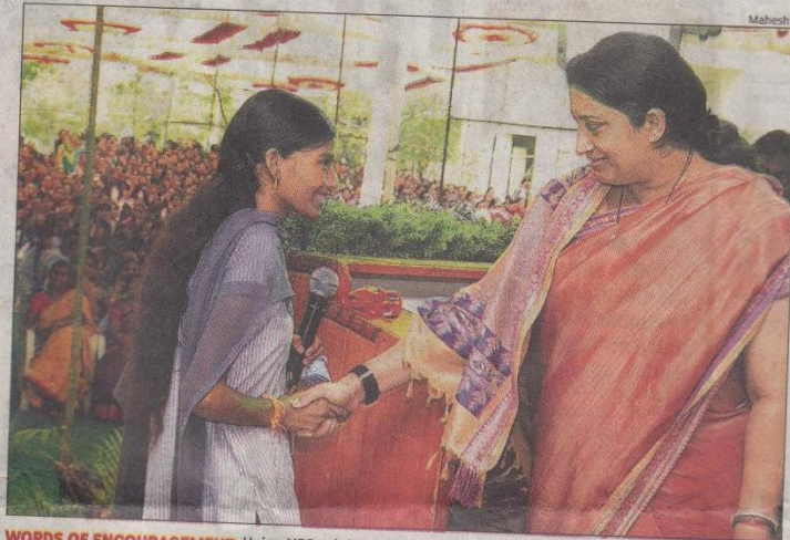
WORDS OF ENCOURAGEMENT: Union HRD minister Smriti Irani interacting with a girl student during a programme held at KBN College in Vijayawada on Tuesday

Smriti Irani, who was on a whirlwind tour of the city on Tuesday, attended several programmes, including a visit to Gujarati Vidyalaya and inaugurating a science lab. She later spent about one hour interacting with students at KBN College. Reacting to a query posed by a student, the minister said that it was not possible for the Centre to enforce uniform syllabus. The student raised the issue keeping in view of the recent decision of Centre to implement the National Entrance-cum-Eligibility Test (NEET) for medical admissions following the Supreme Court's judge-