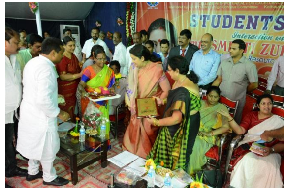
Felicitation to Smt. Smriti Jubin Irani, Human Resource Development Minister