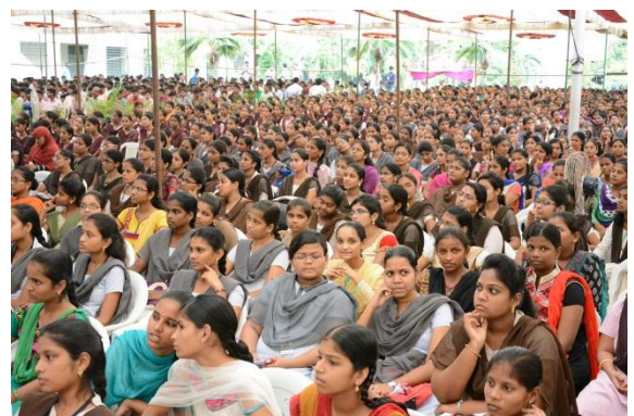
Student participants at the Meet