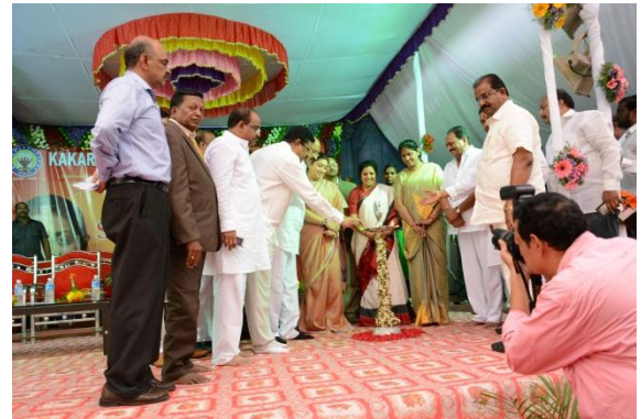
Lightening of the lamp by Honorable Ministers