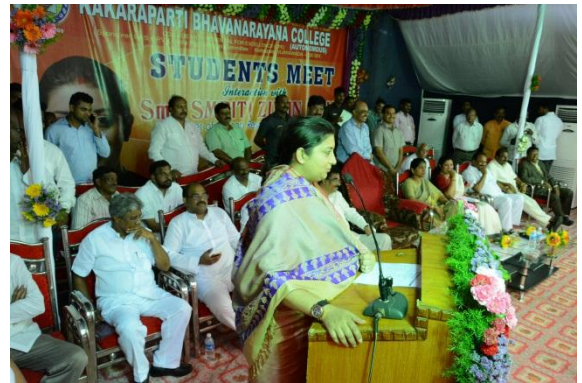
Speech by Smt. Smriti Jubin Irani, Human Resource Development Minister