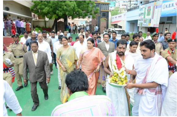
Vedic welcome to Smt. Smriti Jubin Irani, Human Resource Development Minister, Govt. of India