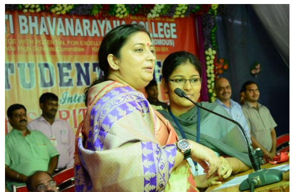
Smt. Smriti Jubin Irani, Human Resource Development Minister interacting with students